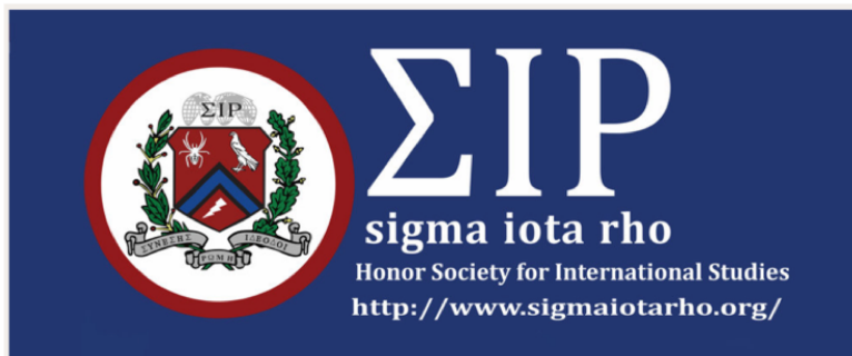
Wall Banner $75