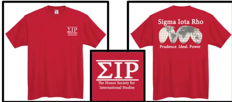
SIR Global T-Shirt $18