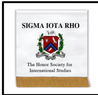
Podium Banner $75

Distinguish Yourself with SIR Induction Package Chapter Enhancements!