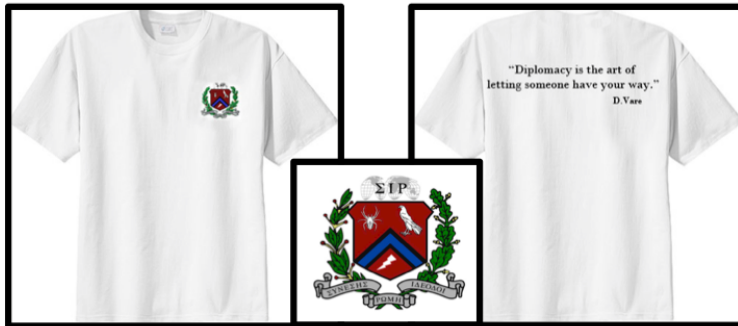
Crest Global T-Shirt $18